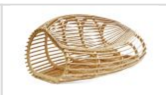
NANANU SIDE Untreated American Ash Hoop pine plywood Stainless steel screws