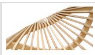
NANANU DETAIL Untreated American Ash Hoop pine plywood Stainless steel screws