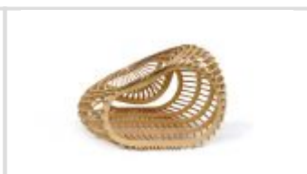
NANANU SIDE VIEW Untreated American Ash Hoop pine plywood Stainless steel screws