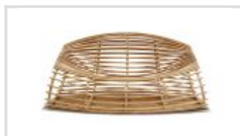
NANANU Untreated American Ash Hoop pine plywood Stainless steel screws